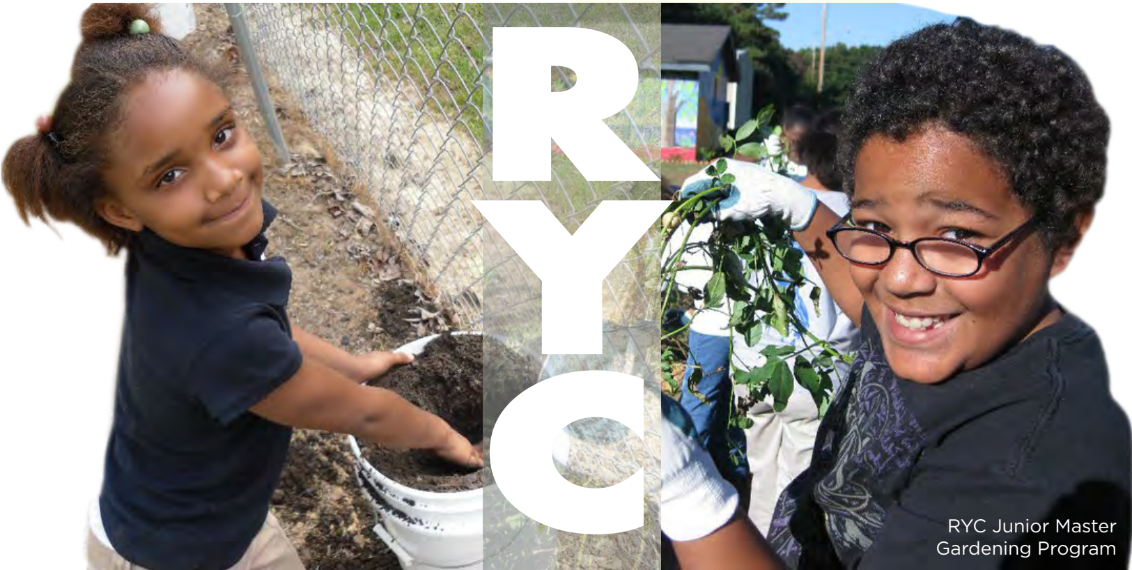
RYC Junior Master Gardening Program

Our mission is to empower youth with skills and experiences that allow them to reach their full potential as productive, caring and responsible members of society.